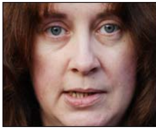
Angela Cannings who spent 18 months in prison and 4 year forced separation from her only surviving daughter until her convictions were overturned in 2003.

Mothers Sally Clark and Angela Cannings were both given life sentences for murdering their children following flawed expert testimonies given by discredited expert witness, Prof. Sir Roy Meadows. Their convictions were quashed in 2003 after it was revealed that their children have most likely died of natural causes.