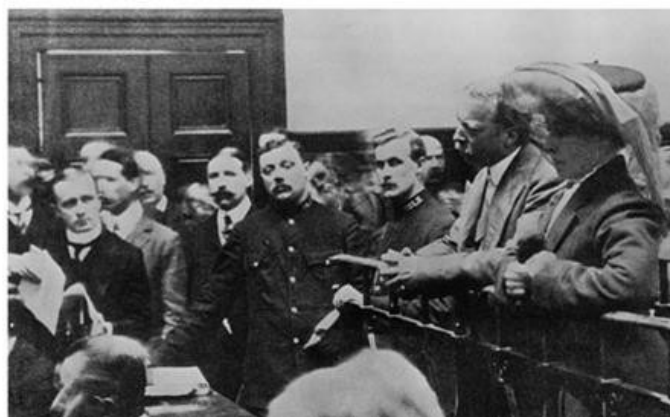
Photograph from the trial of Dr Hawley Crippen

The issues discussed above show how it is now time to reassess, refocus and reform the system of appeals and referrals. The relationship between the CCRC and the Court of Appeal needs to be addressed, with considerations of factual innocence being more acceptable. Furthermore, the recommendations by the RCCJ must be interpreted the way they were intended; focusing on liberalisation of the appeals system. The CCRC needs to make better use of their powers and fulfil the role intended for them. Innocence Projects will continue to play a vital role in investigating claims of innocence and maintaining pressure on the CCRC. I